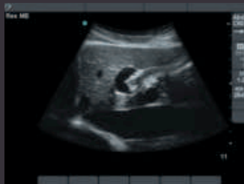
Liver/Aorta, captured using the SonoSite MicroMaxx ultrasound tool and the C60e/5-2 MHz transducer